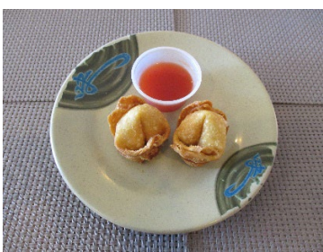
Fried Crab Puffs