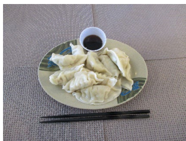
Steamed Pork & Vegetable Dumplings