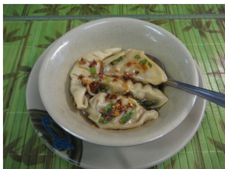
Chili Sauce Chicken Dumplings