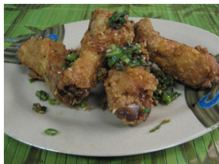
Chili Salt Chicken Wings