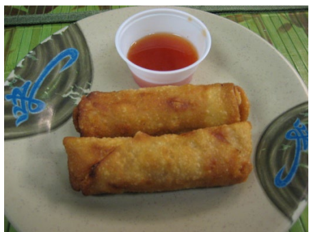
Pork Egg Rolls