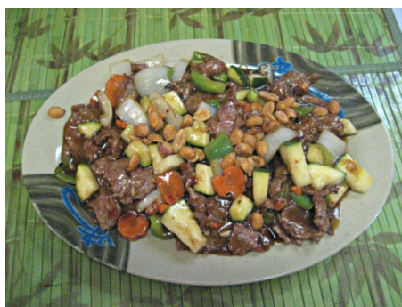
Kung Pao Beef