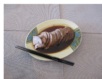
Five Spiced Beef Slices